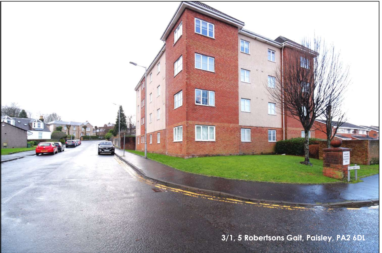
3/1, 5 Robertsons Gait, Paisley, PA2 6DL

This well presented two bedroom top floor apartment is located in this popular modern development just a short distance from the town centre which has a wide range of amenities and public transport links.